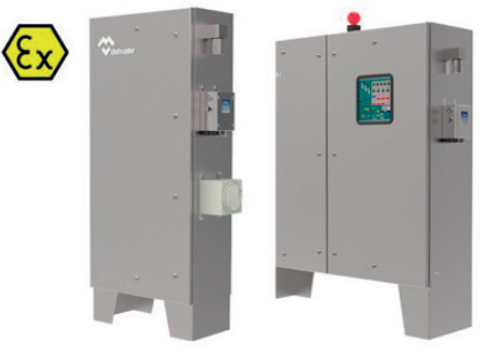
EX ATEX ENCLOSURES