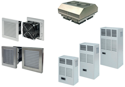
CLIMATE CONTROL SOLUTIONS