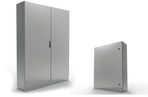
STAINLESS STEEL ENCLOSURES